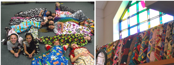
(left) The sixth grade girls made blankets for the children in Honduras. (right) The beautiful quilts are displayed in the Narthex.

Thank you for your support, and please pray for this team as they reach out to our brothers and sisters in Honduras.